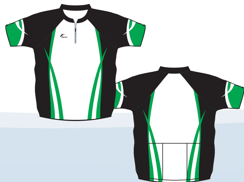
5003 PLASMIC SUNSET